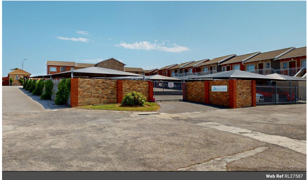
Web Ref RL27587

127 Prospect Road Walmer Port Elizabeth 6070